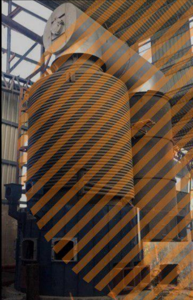
Double coil designs